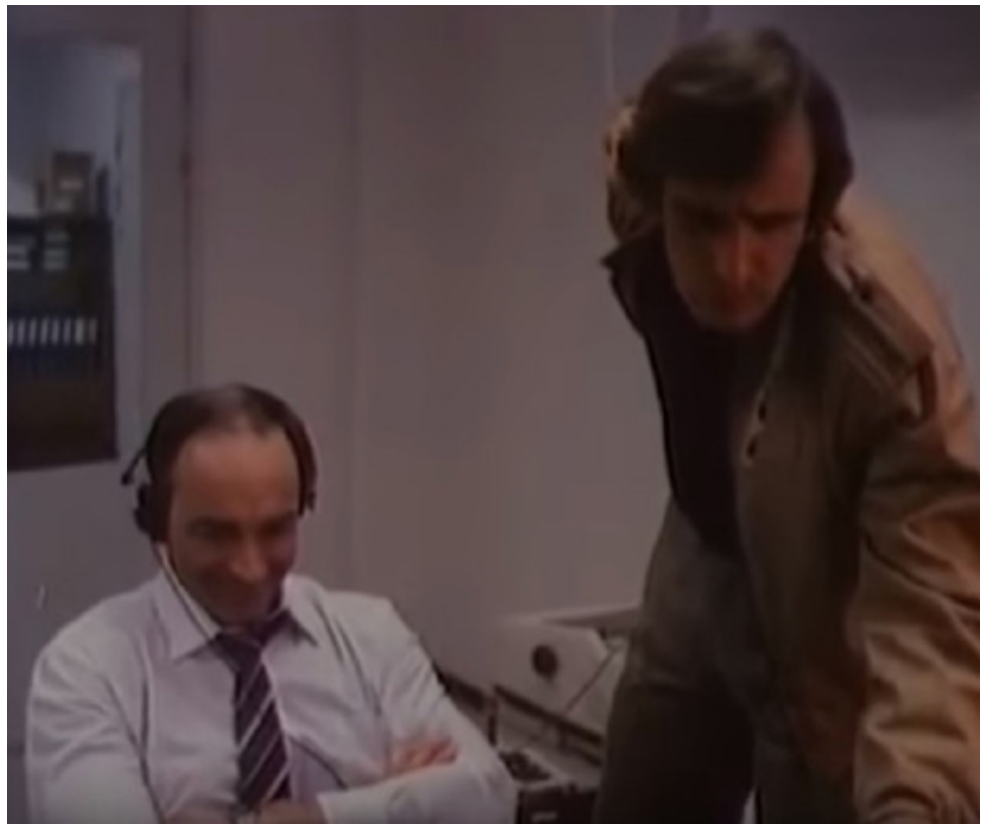
CIA operatives bug Soviet gas officials in Germany. Scene from "Contract of the century" film.